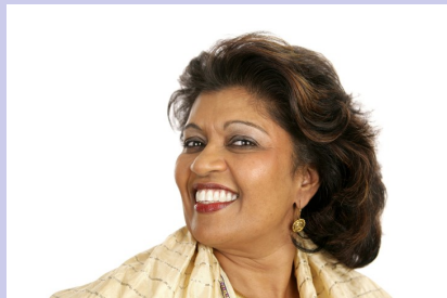
Brady Building Residents set their own plans for recovery ...you can too

Is it time for you to make some life changes? Are you ready to come in from the cold? Brady Building Apartments may be the solution for you.